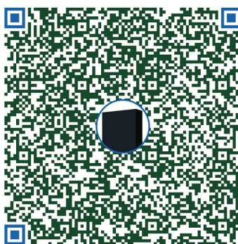
Scan to request samples of Durcon Greenstone